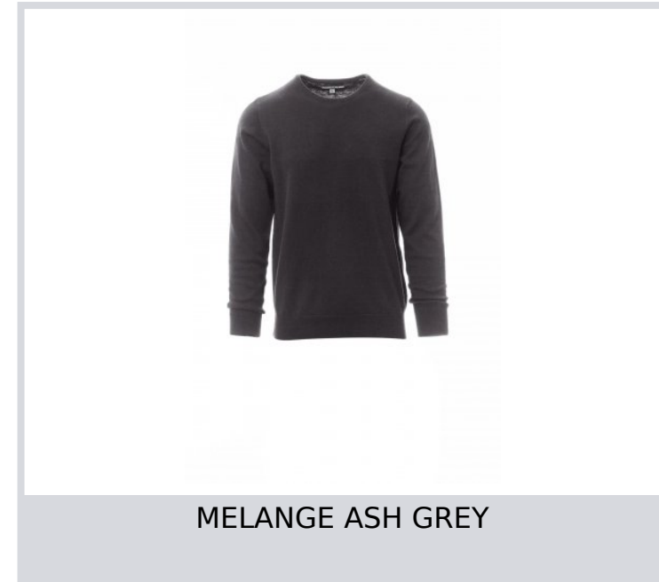
MELANGE ASH GREY