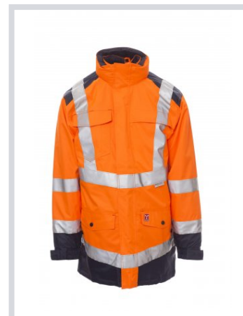
FLUORESCENT ORANGE/NAVY BLUE