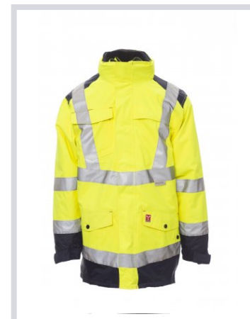
FLUORESCENT YELLOW/NAVY BLUE