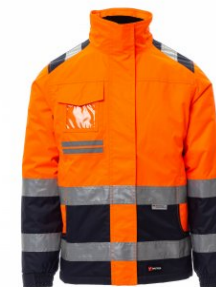
FLUORESCENT ORANGE/NAVY BLUE