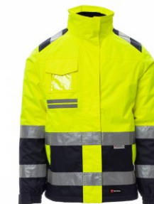
FLUORESCENT YELLOW/NAVY BLUE