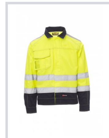
FLUORESCENT YELLOW/NAVY BLUE