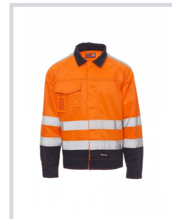
FLUORESCENT ORANGE/NAVY BLUE