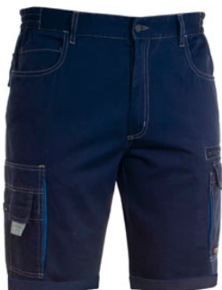
NAVY BLUE/ROYAL BLUE