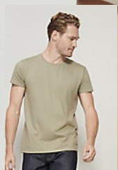
SOL'S PIONEER MEN 03565