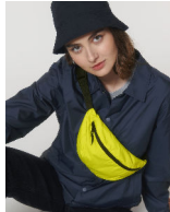
Lightweight Hip Bag

Shell : Plain Weave , 100% Recycled polyester , Fluorine-free DWR , 75 GSM