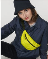
Lightweight Hip Bag

Shell : Plain Weave , 100% Polyester - Recycled , Fluorine-free DWR , 75 GSM Lining : Taffeta , 100% Polyester - Recycled , 60 GSM