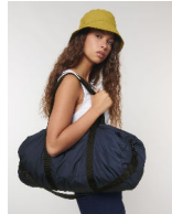
Lightweight Duffle Bag

Shell : Plain Weave , 100% Recycled polyester , Fluorine-free DWR , 75 GSM