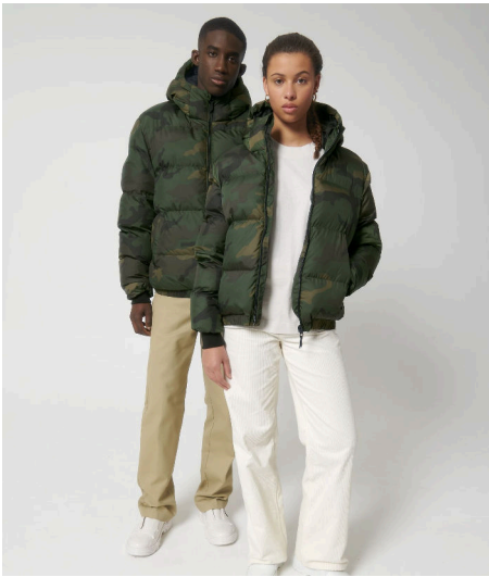
ALL OVER PRINT