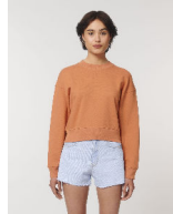
Stella Cropster Wave Terry

Shell : Terry Sweatshirt, 85% Organic ring-spun combed cotton , 15% Recycled polyester , Fabric washed , Light sueded , 300 GSM