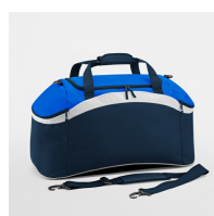
French Navy/Bright Royal/White